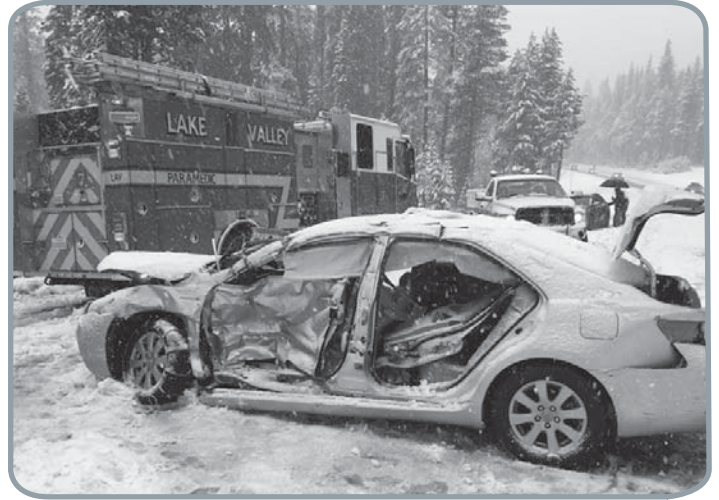
Fire engine arriving at a fire at motor vehicle accident

Additionally, the special tax approved by the voters in 1986 has never been increased . Therefore, and despite all these budget cuts and the recent improvements in the local economy, the Fire District's current revenue is not adequate to continue providing services at a level that is safe for the community, and costs will still continue to increase over time. This continually expanding funding gap can no longer be bridged by cost cutting solutions alone.