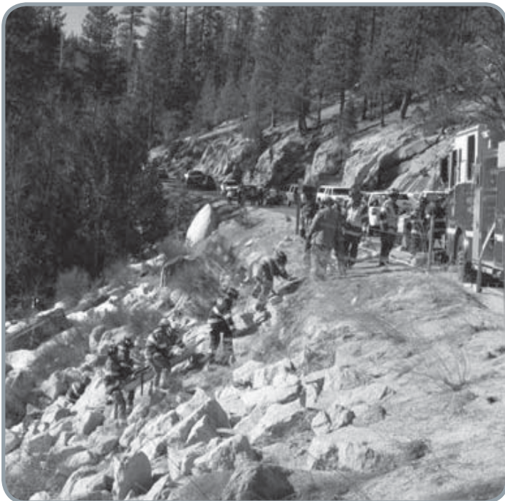
Fire District carrying injured motorist uphill

The Lake Valley Fire Protection District was formed in 1947, is an independent special district, and is governed by a locally elected five member Board of Directors. The Fire District serves a population of over 12,000 residents and covers an area of approximately 86 square miles, protecting the community of Meyers and areas extending north to the El Dorado/Placer County line on Hwy 89 north, west to Twin Bridges on Hwy 50, south to the El Dorado/Alpine County line on Hwy 89 south, and east to the limits of South Lake Tahoe. Currently the Fire District is staffed with 28 full time firefighters.